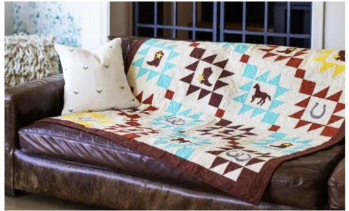
Western Dance quilt pattern

June 1 st begins our new fiscal year. We will be taking membership dues beginning with our May Salad Supper. I will have registration forms printed out for you to grab, review, correct if needed, then sign and return to me with your $30 membership for the 2026-2027 membership year.